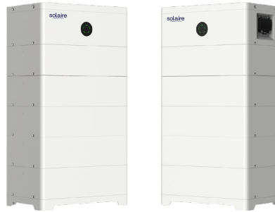
T-HS25.6 T-HS30.7 T-HS35.8 T-HS40.9 T-HS46.0 T-HS51.2 T-HS56.3 T-HS61.4 T-HS66.5